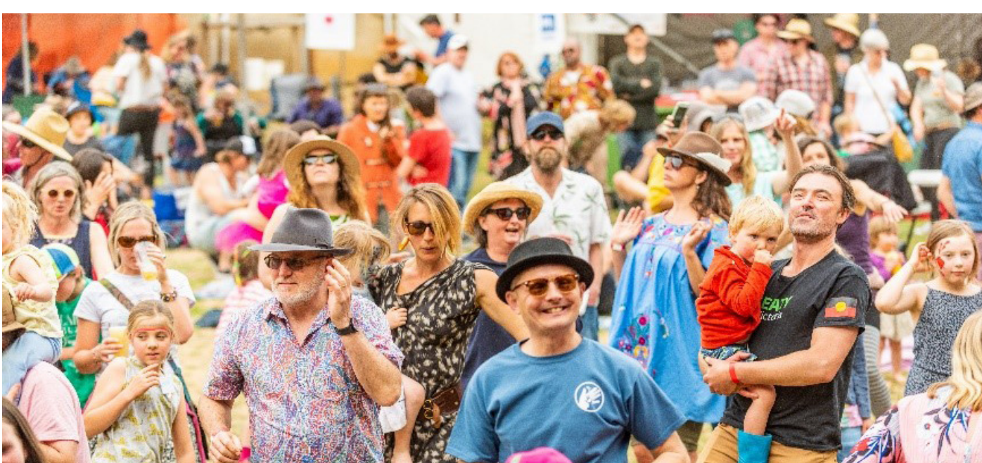
From Little Things Community Festivals