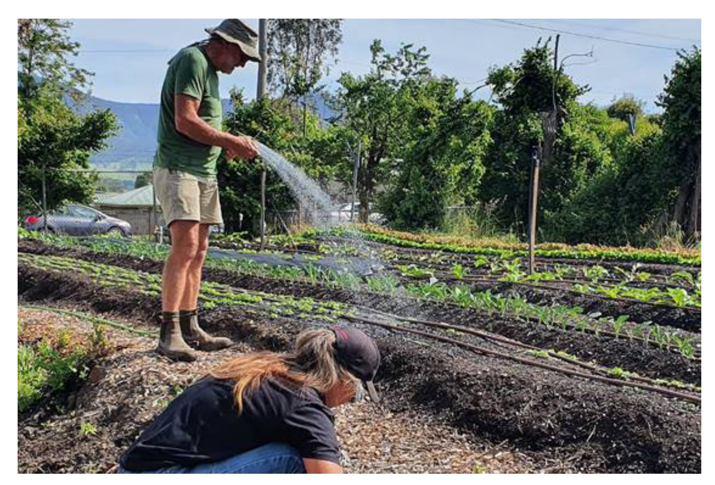
Acres and Acres community garden taking shape.

The brigade conducts community training for the upcoming fire season. It offers new locals the opportunity to mix and mingle whilst having the chance to extend their knowledge of the coming fire season. The existing facilities are rudimentary at best, and the group used the grant to upgrade the sink, bench and storage space.