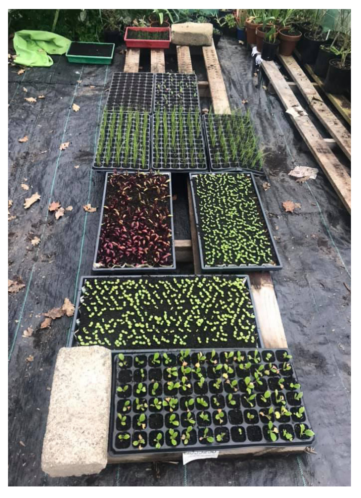
Seedlings from the Acres and Acres Cooperative community garden

Into Our Hands Community Foundation established a new charitable trust to manage the balance of VBAF funds in perpetuity. The fund was registered and settled on 3 July 2019. The Trust has no activity to report for the 19.20 financial year and will be used for the benefit of 2009 fire-affected communities of Black Saturday.